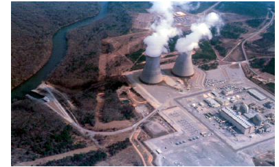
Cooling towers at Plant Vogtle along Savannah River

For instance, coal-fired Plant Branch withdraws over a billion gallons of water per day from Lake Sinclair, but consumes a few million gallons of water because of its primary reliance on once-through condenser cooling water and only seasonal use of its cooling tower. Georgia's nuclear plants Hatch and Vogtle use cooling towers for condensing steam, resulting in less water withdrawn (around 60 million gallons per day) but with a much greater volume of water consumed or lost (between 34 and 43 million gallons per day). This ultimately results in these plants returning less than half of the water withdrawn to the Altamaha and Savannah rivers respectively. With the proposed expansion of Plant Vogtle, more water will be lost as steam from the two existing and two proposed reactors than is currently used by all residents of Atlanta, Augusta, and Savannah combined . 4