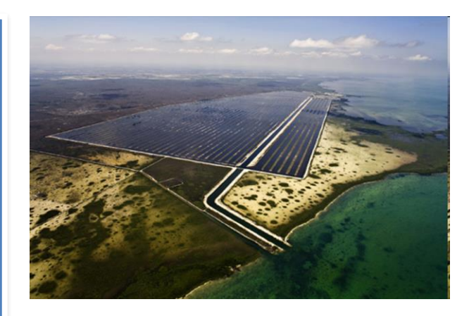
Cooling canal system at FPL's Turkey Point which recent study shows are contaminating the Biscayne aquifer and National Park.