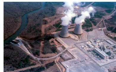
Cooling towers at Plant Vogtle along Savannah River

For instance, coal-fired Plant Branch withdraws over a billion gallons of water per day from Lake Sinclair, but consumes a few million gallons of water because of its primary reliance on once-through condenser cooling water and only seasonal use of its cooling tower. Georgia's nuclear plants Hatch and Vogtle use cooling towers for condensing steam, resulting in less water withdrawn (around 60 million gallons per day) but with a much greater volume of water consumed or lost (between 34 and 43 million gallons per day). This ultimately results in these plants returning less than half of the water withdrawn to the Altamaha and Savannah rivers respectively. With the proposed expansion of Plant Vogtle, more water will be lost as steam from the two existing and two proposed reactors than is currently used by all residents of Atlanta, Augusta, and Savannah combined . 4